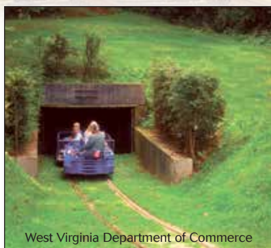
West Virginia Department of Commerce