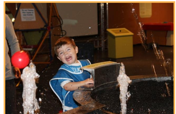
OH WOW! Children's Center for Science & Technology

Following lunch, meet up with more animal friends at Wagon Trails Animal Park . You'll feel like you're on an African Safari as you ride the wagon to explore 60 acres of woods and ponds. You will also get to feed the animals as they come up to the wagon to say hello.