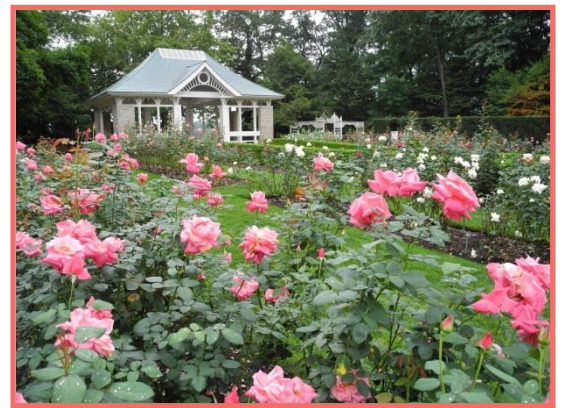
Mill Creek MetroParks - Fellows Riverside Gardens

Enjoy a delicious lunch at Overture Restaurant , located adjacent to historic Powers Auditorium . As an add-on to lunch, take a peek inside "the finest theater ever built", originally built by the Warner Brothers and opened in 1931.