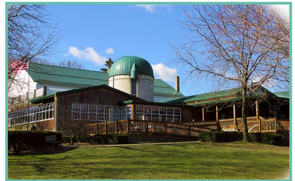
White House Fruit Farm

Next, visit White House Fruit Farm in Canfield. Your group will enjoy all this fantastic Ohio Century Farm Market has to offer including fresh produce, deli, jams, honey, maple syrup, cheeses, homemade fudge and fresh bakery items including their famous blueberry donuts! We can arrange for your group to have a donut, cup of cider and bag of apples on the bus.