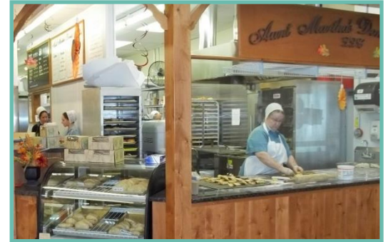
The Valley Marketplace

Day one begins at The Valley Marketplace , Ohio’s only indoor Amish Market. There are over 30 vendors selling their products, including fresh baked breads, pies, cinnamon buns, fry pies, Philadelphia soft pretzel sandwiches, Middlefield homemade cheese and deli, Amish made furniture, genuine Amish restaurant, Amish wicker products, Amish gifts, fresh Butcher shop, fresh fruit and produce, and much more.