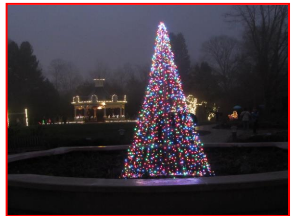
Winter Celebration Fellows Riverside Gardens – Mill Creek MetroParks

Enjoy the Winter Celebration display at Fellows Riverside Gardens . In the Davis Visitors Center, enjoy a stroll through the beautiful displays and the annual holiday tree walk. Every Saturday and Sunday, the Gardens are open late for visitors to experience the Electric Garden, where the grounds will be lit with thousands of twinkling lights. Plus, find that perfect gift at the Shop in the Gardens and savor refreshments available for purchase in the Garden Café.