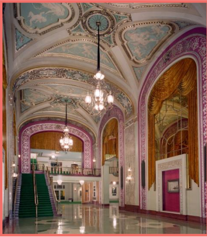
Powers Auditorium Lobby DeYor Performing Arts Center

Enjoy the finer things in life on this great trip to the Mahoning County!