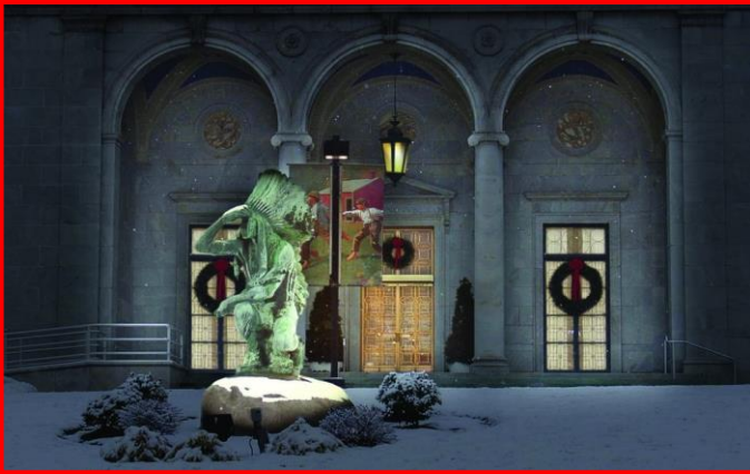
The Butler Institute of American Art

Shop for one-of-a-kind holiday gifts at the 46th Annual American Holiday Fine Arts & Craft Show held at the Butler Institute of American Art . This juried show features visual artists and craftspeople showcasing the best of their work.