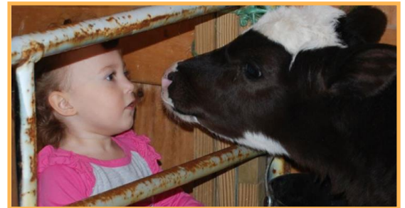
Mill Creek MetroParks Farm

Following lunch, explore Lanterman's Mill and Covered Bridge , also part of beautiful Mill Creek MetroParks. Constructed in 1846, the mill has been completely restored and still operates today. Tour guides can also lead a hike along the gorge for your group.