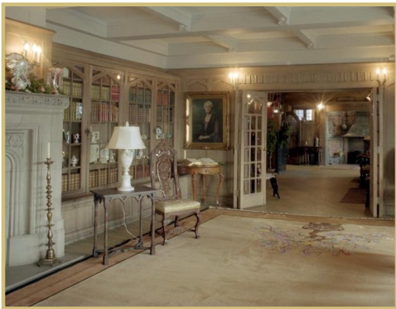
Arms Family Museum

Enjoy a delicious lunch at Overture Restaurant , located adjacent to historic Powers Auditorium . As an add-on to lunch, take a peek inside “the finest theater ever built”, opened in 1931. This theater was originally built by the Warner Brothers who lived in Youngstown prior to moving to Hollywood to start their movie empire. The Brothers built this magnificent theater as a tribute to Sam Warner, considered to be the father of the talking motion picture.