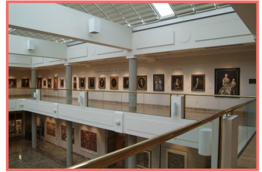
Butler Institute of American Art

End your day at Mastropietro Winery . Enjoy wine tastings in a beautiful setting. Group-friendly dining for your group can also be arranged.