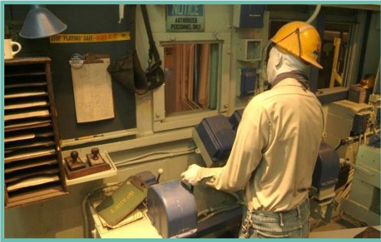
Youngstown Historical Center

Enjoy a delicious lunch at Overture Restaurant , located adjacent to historic Powers Auditorium . After lunch, your group will tour “the finest theater ever built”, originally built by the Warner Brothers and opened in 1931.