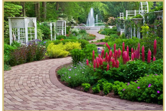
Mill Creek MetroParks - Fellows Riverside Gardens

First stop is a visit to the Davis Visitors Center at lovely Fellows Riverside Gardens at Mill Creek MetroParks . Enjoy this beautiful 12-acre public display garden and its colorful plant displays, annuals, perennials, trees and scenic vistas.