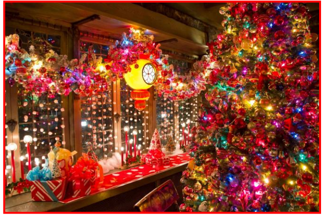
Memories of Christmas Past Arms Family Museum