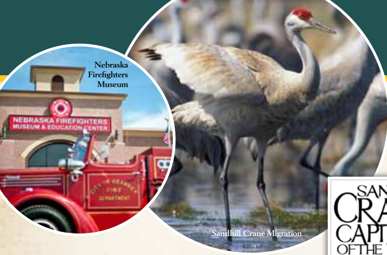
Nebraska Firefighters Museum