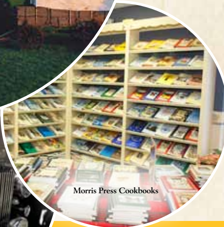
Morris Press Cookbooks