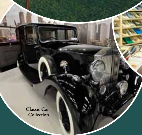
Classic Car Collection