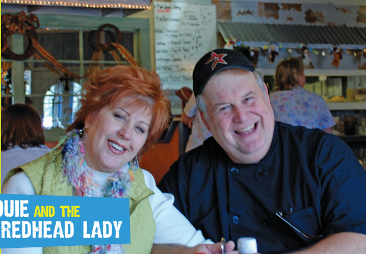
LOUIE AND THE REDHEAD LADY

St. Tammany Parish offers scenic beauty and memory-making experiences, and is within an hour of New Orleans, Baton Rouge and the Mississippi Gulf Coast. You'll find picturesque green spaces, a diverse culinary scene, an eclectic collection of galleries and boutiques, one-of-a-kind attractions and festivals all year long. Explore the Northshore through the personalities of each charming town.