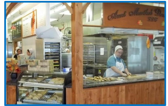
The Valley Marketplace

Day one begins at The Valley Marketplace , Ohio’s only indoor Amish Market. There are over 30 vendors selling their products, including fresh baked breads, pies, cinnamon buns, fry pies, Philadelphia soft pretzel sandwiches, Middlefield homemade cheese and deli, Amish made furniture, genuine Amish restaurant, Amish whicker products, Amish gifts, fresh Butcher shop, fresh fruit and produce, and much more.