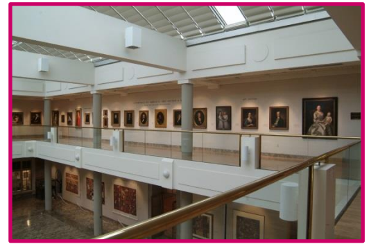
Butler Institute of American Art

End your day at Mastropietro Winery . Enjoy wine tastings in a beautiful setting. Group-friendly dining for your group can also be arranged.