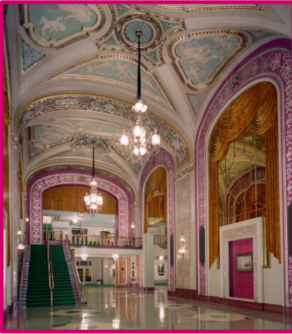
Powers Auditorium Lobby DeYor Performing Arts Center

Enjoy the finer things in life on this great trip to the Mahoning County!