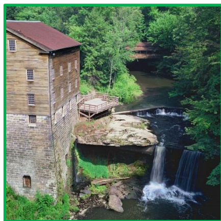
Lanterman's Mill & Covered Bridge

Lunch will be provided at Overture Restaurant with a quick peek at historic Powers Auditorium located next door, originally built by the Warner Brothers and opened in 1931.