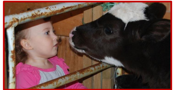
Mill Creek MetroParks Farm

Following lunch, explore Lanterman's Mill and Covered Bridge , also part of beautiful Mill Creek MetroParks. Constructed in 1846, the mill has been completely restored and still operates today. Tour guides can also lead a hike along the gorge for your group.