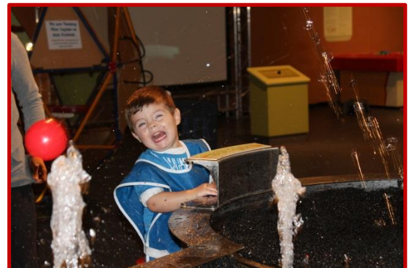
OH WOW! Children's Center for Science & Technology

Following lunch, meet up with more animal friends at Wagon Trails Animal Park . You'll feel like you're on an African Safari as you ride the wagon to explore 60 acres of woods and ponds. You will also get to feed the animals as they come up to the wagon to say hello.