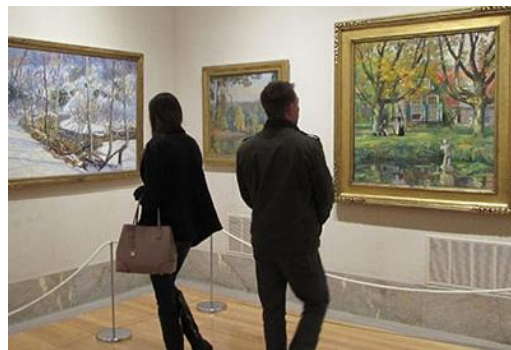
Butler Institute of American Art

Begin your day at the world-renowned Butler Institute of American Art . Docents will lead your group through this beautiful museum which houses a vast collection of the finest works of art created solely by American artists. Known as “America’s Museum”, the museum’s collection totals over 22,000 pieces in all media, and spans four centuries of work. The original museum structure is a McKim, Mead and White architectural masterpiece listed on the National Register of Historic places. The Butler celebrated its 100th anniversary in 2019.