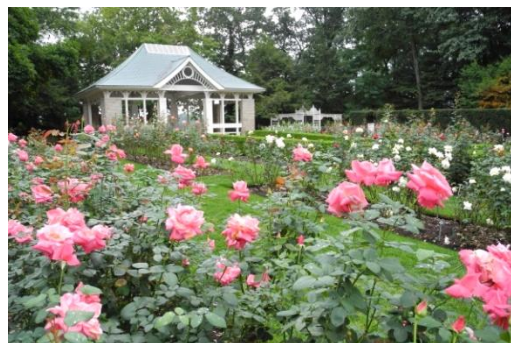
Fellows Riverside Gardens

Next, enjoy visiting lovely Fellows Riverside Gardens . Part of Mill Creek MetroParks, this twelve-acre display garden features a landscape of remarkable beauty with diverse and colorful plant displays, roses of all classes, seasonal displays of annuals, perennials, and flowering bulbs, and scenic vistas. Allow time for the Davis Visitors Center and stroll through the gift shop, art gallery, and climb the observation tower for spectacular views.