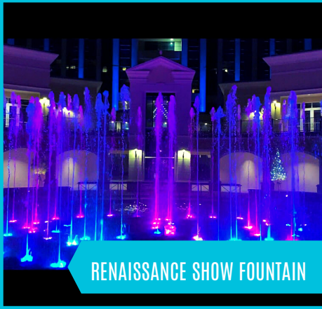
RENAISSANCE SHOW FOUNTAIN