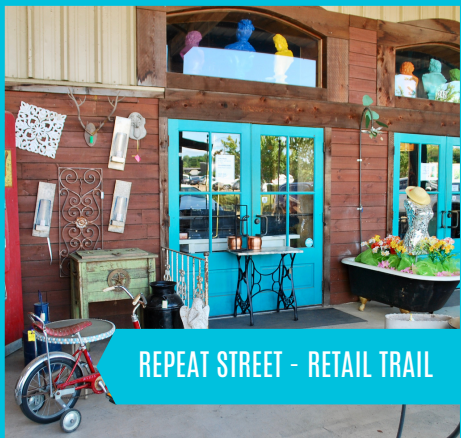
REPEAT STREET - RETAIL TRAIL