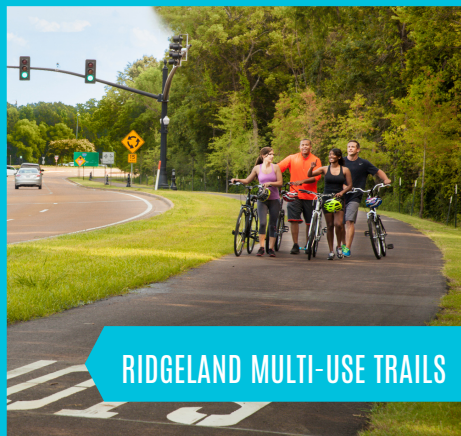
RIDGELAND MULTI-USE TRAILS