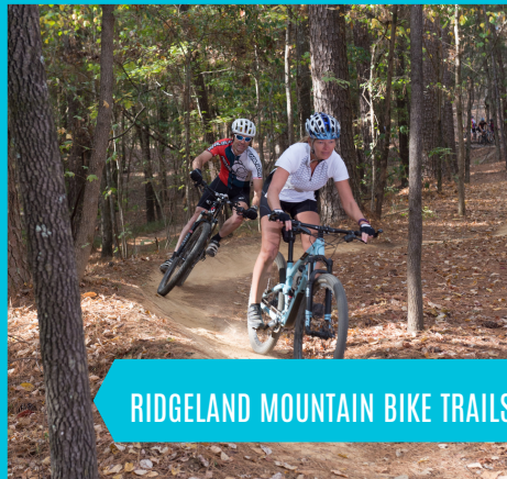
RIDGELAND MOUNTAIN BIKE TRAILS