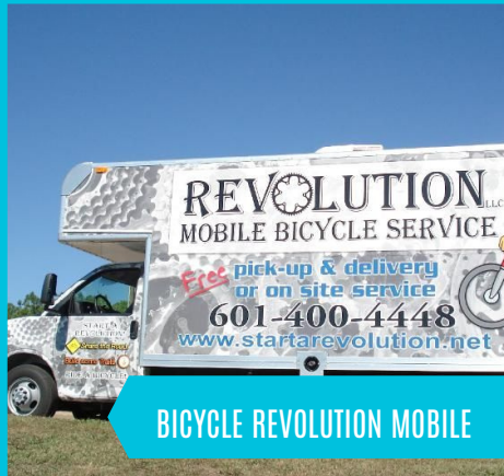
BICYCLE REVOLUTION MOBILE