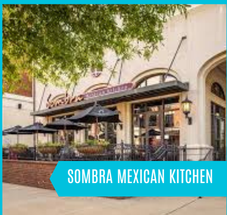
SOMBRA MEXICAN KITCHEN