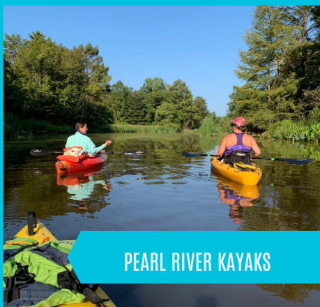
PEARL RIVER KAYAKS