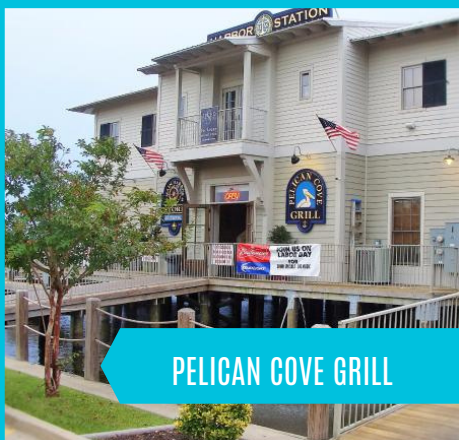
PELICAN COVE GRILL