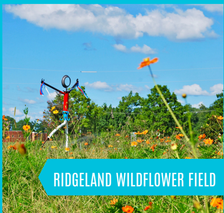
RIDGELAND WILDFLOWER FIELD