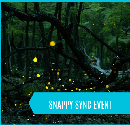
SNAPPY SYNC EVENT

off into the sunset with a cruise around the Rez' on the Sweet Olive Tour Boat . Sweet Olive has heating and cooling to meet your needs no matter what time of year.