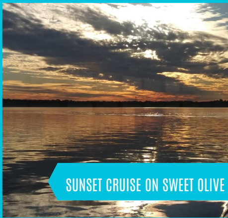
SUNSET CRUISE ON SWEET OLIVE

back in time to the old riverboat era as you enjoy catfish golden fried, pots of greens, and cornbread flipped in the pan right before your very eyes. You'll know you've entered Ridgeland's Cock of the Walk , an original Mississippi Catfish House when your server tips their feathered cap to you!