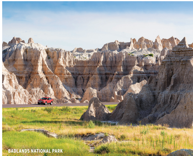
BADLANDS NATIONAL PARK

TRAVEL PLANNER TIP: Take time to enjoy one of the over 300 events that occur yearly at Main Street Square, located in Downtown Rapid City.