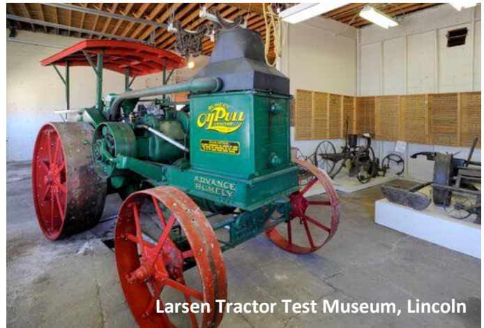
Larsen Tractor Test Museum, Lincoln

Walk through the only tractor testing museum and tractor test laboratory in the world. On display are more than 25 tractors highlighting the advancements in tractor testing technology, which established power and performance standards and solved agricultural problems around the world.