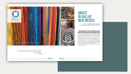
8 PAGE FEATURE